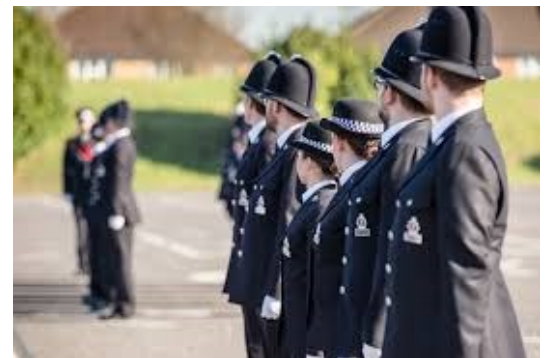
Kent Police recruits passing out parade before they join local teams across the county

Currently Kent residents pay the seventh lowest policing precept in the country: £193.15 a year for a Band D home. The PCC's proposal for a 5.2% increase has been voted on and subsequently agreed by the Police and Crime Panel. The annual contribution for a Band D property in 2020/21 is now set at £203.15.